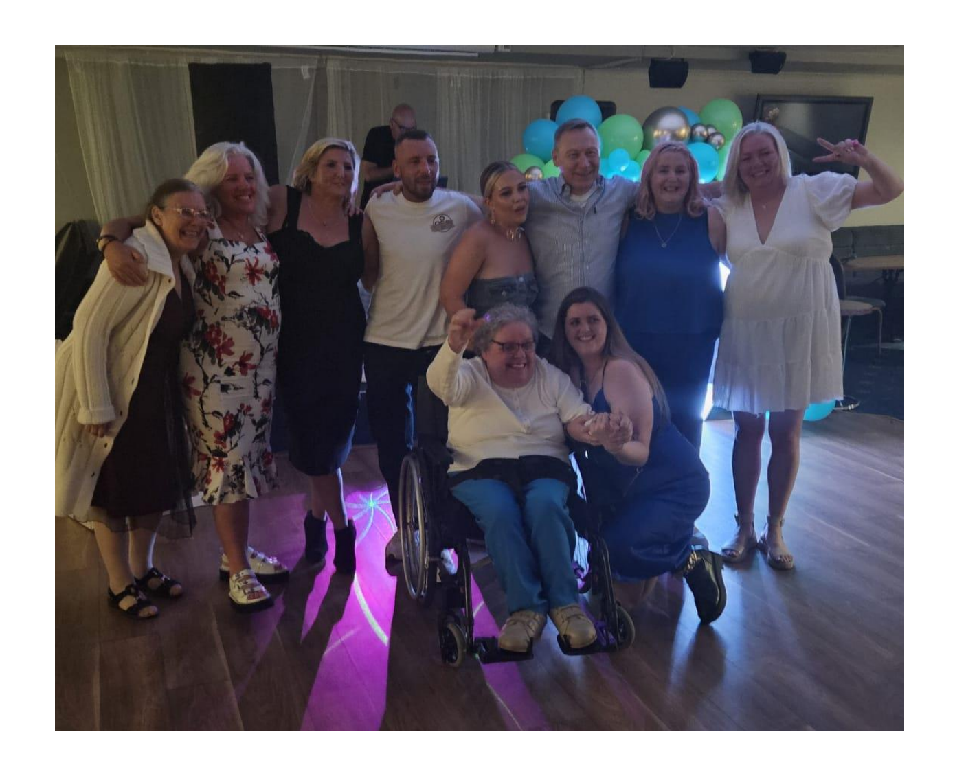
Phew!! What a month!

Once again, we'd like to thank everyone who took part in making this event so successful. We couldn't do it without your generous support!