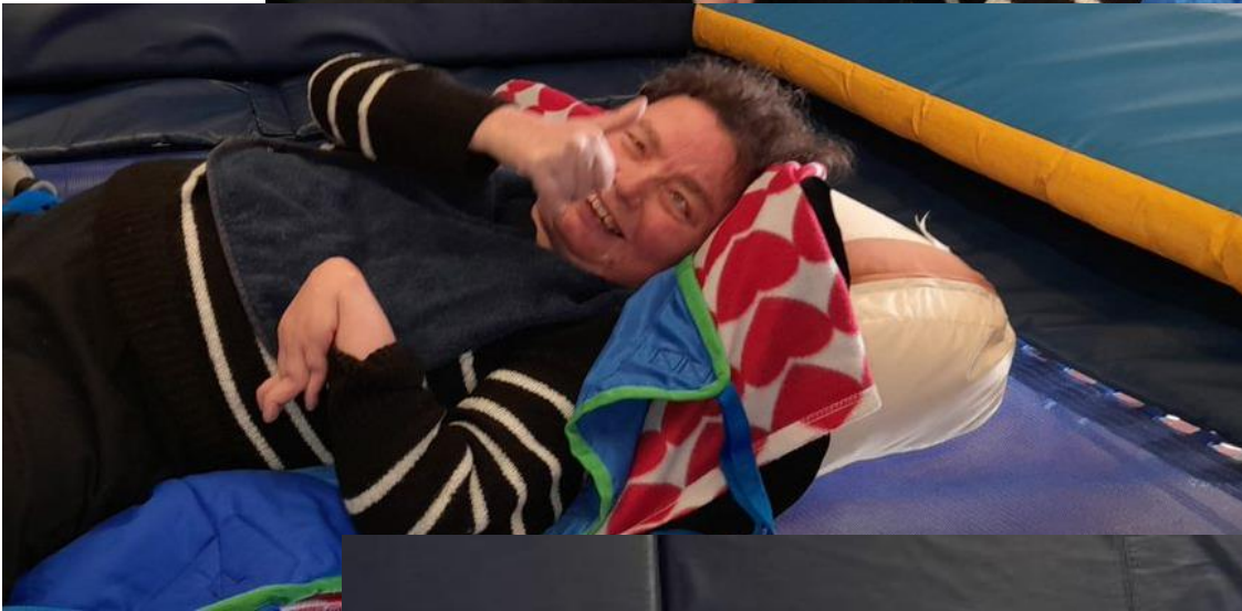
A wee thumbs up to let you know how good it is!