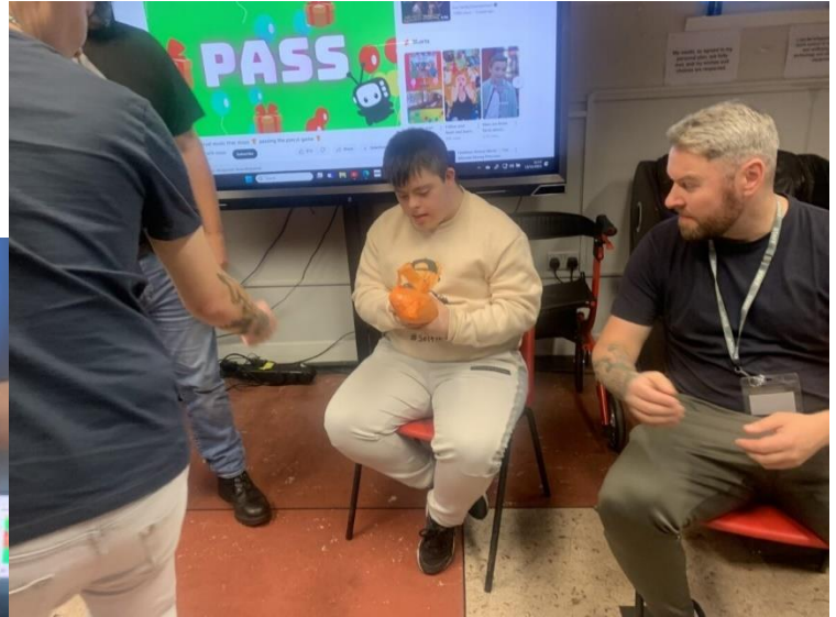
Everyone had a fabulous time!