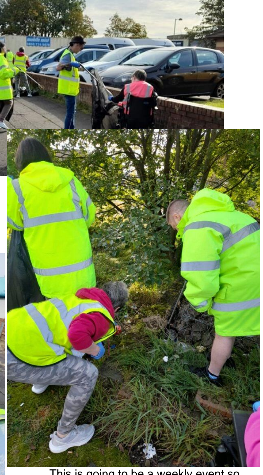
This is going to be a weekly event so expect more pictures in further issues of the Newsletter.