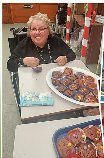
Time to enjoy them!

To make the filling, put the ricotta, eggs, vanilla and melted chocolate in a large mixing bowl. Sift in the icing sugar. Beat everything together with an electric whisk or a wooden spoon until very well combined. Spoon into the paper cases right up to the tops, then tap the whole tin on the bench to get rid of any air bubbles. Bake for 30 mins, then remove from the oven and gently push 3 mini eggs into the top of each cheesecake. Let the cheesecakes cool completely before serving. Can be kept in the fridge for up to 3 days.