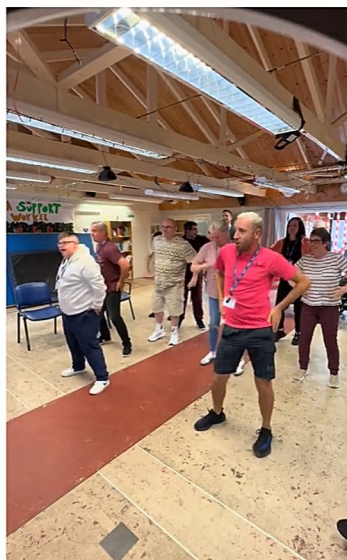
Check out our TikTok @antoninecourt

I love working at Antonine, it's a great place to work at.