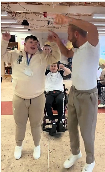
We-re singing, we're dancing, we're doing challenges, ...