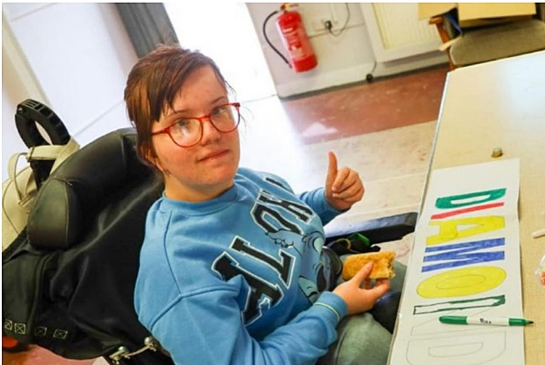
Service users and staff worked together at the event last weekend

DRUMCHAPEL CHARITY EVENTS LEISURE GLASGOW